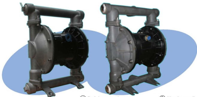
① Stainless steel