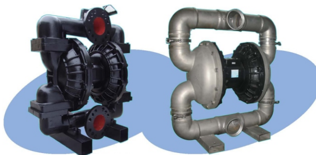
① Aluminum alloy