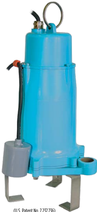
(U.S. Patent No. 7,237,736)